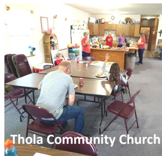
Thola Community Church