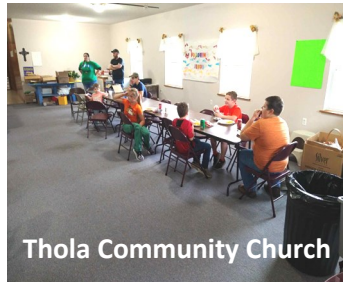
Thola Community Church

We shared the need for a new commercial lawn mower. $4,765 has been raised specifically to go towards the John Deere Lawn Mower at a cost of $8,500. We have