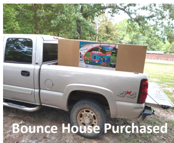
Bounce House Purchased