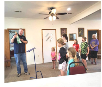
Rock Haven on the Go at The Church at Silver Valley