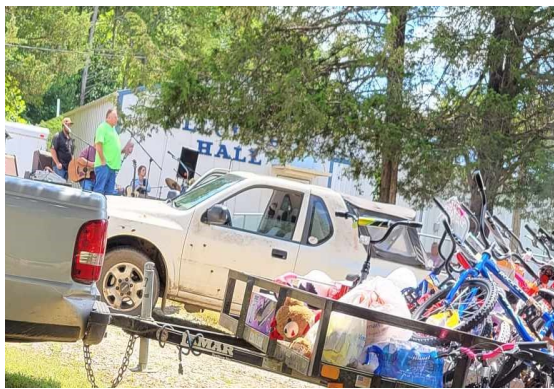
Rock Haven On The Go at Mt Judea Bikers event.